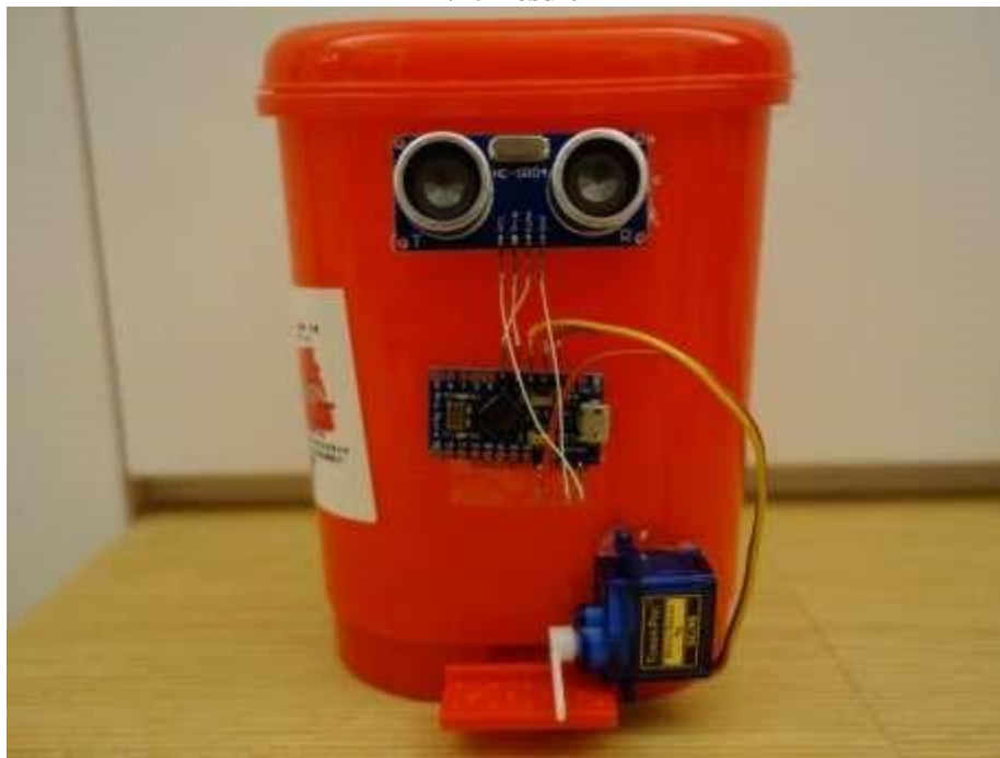
Fig.: Wi-Fi Dustbin System